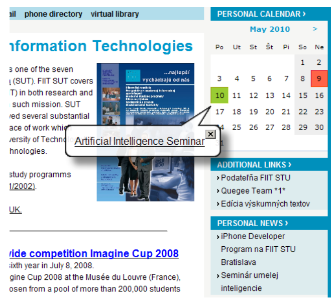
Figure 3. Calendar (shows recommended event on 10/05/2010), additional links and personal news sections.

We monitor the portal and capture every change in text of a web page (this could be for example a change in time and place of some event). Every changed page is marked as news and added to a special news section. We also recommend other potentially interesting links which are neither events nor news . Figure 3 shows part of a web page enhanced with personalized sections.