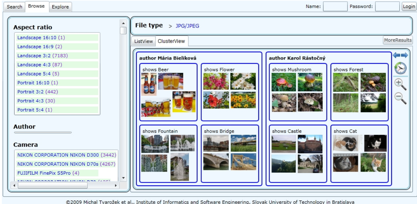
Figure 1. Example of the hierarchical cluster view integrated in Factic. First-level clusters contain four most prominent second-level clusters, which display four representatives with the highest membership degree. Buttons on the right facilitate navigation in user action history and zoom.

browser Factic [11] with additional support for query modification, result selection and exploration via: