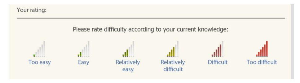
Fig. 1. Student rating estimation interface shown after interaction with exercise-type or question-type learning object.