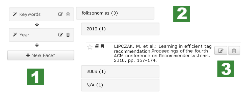
Fig. 1. Example of a facet tree hierarchy, with Keywords and Year facets selected (1). Folder with keyword folksonomies (2) is expanded showing three subfolders containing also NA value. User can edit the resource and its metadata or remove it from the collection (3).

Facet tree allows the users to define hierarchies of the selected facets, thus automatically organizing their collection of documents. An example of such a hierarchy can be seen in Fig. 1; the user selected Keywords facet representing the keywords added to the documents by their authors at the first (root) level and Year facet representing the publication year at the second level.